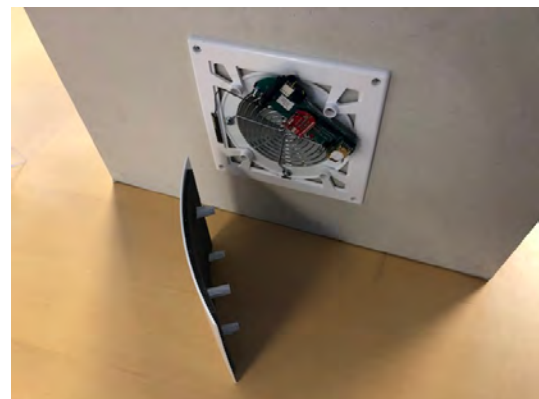
Fig 4 - fan cartridge (from stale air side)