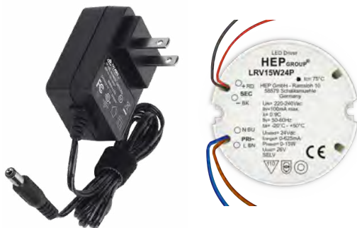
fig 3 - External power supply (left) Build-in power supply (right)