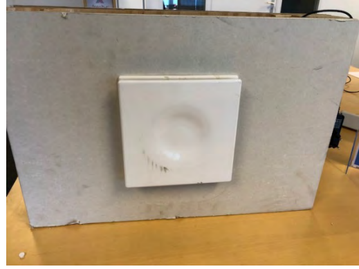
fig 6 - flat grill fitted on dormant side