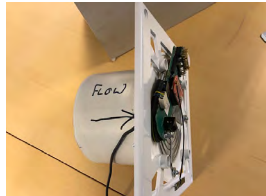
fig 2- Fan cartridge