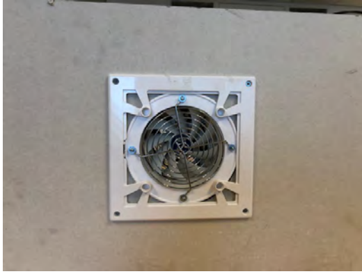
fig 5 – installed dormant cartridge