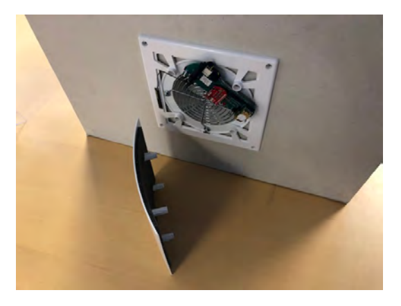
Fig 4 - fan cartridge (from stale air side)