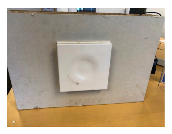
fig 6 - flat grill fitted on dormant side