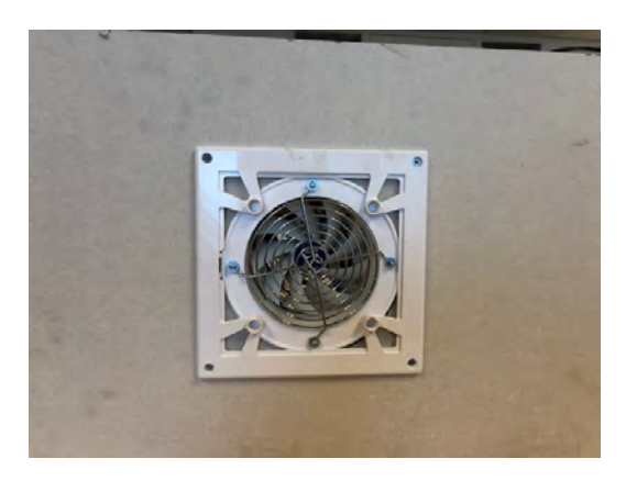
fig 5 – installed dormant cartridge