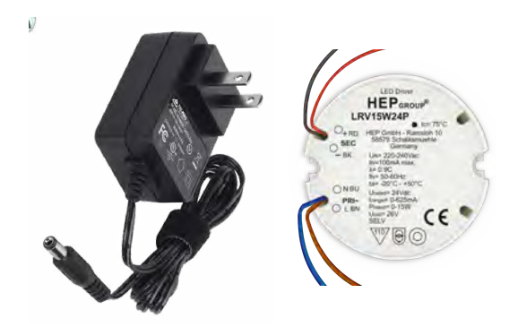
fig 3 - External power supply (left) Build-in power supply (right)