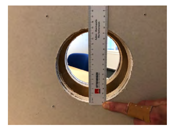
fig 1- Core hole trough the wall

Minimum wall thickness is 12cm and there is no specific maximum wall thickness as the fan cartridge and dormant cartridge can be separated to suit the thicker wall.